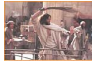
Thieves in Your Temple

The UUCF will present the General Assembly Communion Service on Thursday, June 23, from 4:30 to 5:45 p.m. at the Convention Center Room 203AB in Charlotte, North